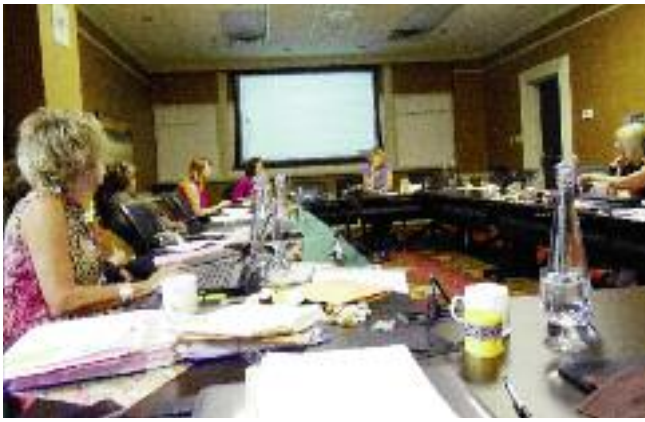
SRC Calendar of Events