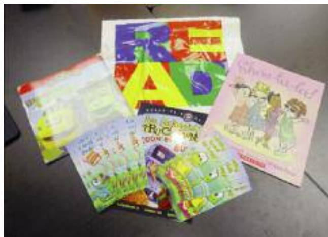
SRC Read to Me Books

The most important reason to read aloud is that it strengthens the bond between the things your baby loves the most, your voice and physical closeness to you and, of course, books. Spending time reading to your baby clearly demonstrates that reading is a valuable skill, a skill worth learning. Cuddling during read alouds and reading aloud with enthusiasm, joy, excitement and pleasure helps your baby associate books with happiness. This is how budding readers are created.