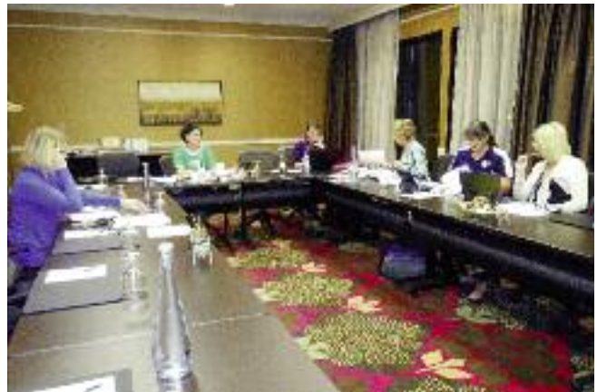
SRC Strategic Planning

An effective reading program incorporates a variety of activities in order to give children positive attitudes toward literacy, as well as the knowledge, strategies, and skills they need to be successful readers. Studies point to a number of instructional practices that can promote literacy learning. The effectiveness of best practices are dependent upon on how well they fit with student need in learning to read. For example, students who already know letter-sound