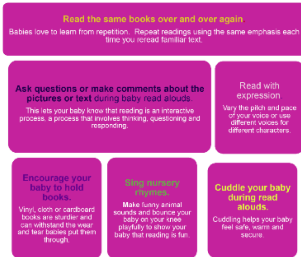
Figure 1. Strategies for Baby Read Alouds (Project L.I.F.T., 2014b)

that provide opportunities for your child to repeat simple words or phrases. Books with mirrors, pop-up/fold-out books and those containing a variety of textures (ie. fluffy, smooth, scratchy, feathery, spongy, bumpy, knitted, stubbly, ribbed, soft, sandy, etc.) are also terrific for this age group. Babies of any age like photo albums with pictures of people they know and love. You will also want to ensure your child has a collection of favourite nursery rhymes. Having books around your home will ensure that your child grows up to be a reader. When your child is old enough to crawl and choose toys from a toy box, make sure there are books included in the toy box. Mothers of newborn babies in hospitals and/or at wellness clinics in Saskatchewan are provided with a Read to Me book bag containing two books and information from the Saskatchewan Reading Council about the benefits of reading aloud to their babies from birth (Saskatchewan Reading Council, 2014a,b). In addition to the books you own and receive as gifts, take advantage of those you may borrow from the library. Many libraries have storytimes just for babies (Quick, 2014; Read to Me, 2014). Be sure to pick up a book for yourself while you are there! Reading for pleasure is another means of being your baby's role model.